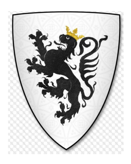
Fig. 2. Arms 14th century used by Burnel

accepted the right of Burnel to the arms, and in order to effect a compromise, sent the Earl of Lancaster and other lords to Nicholas requesting that he would permit Robert de Morley to bear the disputed arms for his lifetime only. Nicholas, out of respect for the King, agreed to this, and the High Constable and Earl Marshal gave judgment accordingly. The judgment was proclaimed by a Herald in the presence of the assembled army at Calais.