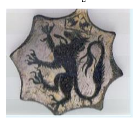
Fig 1. 14<sup>th</sup> Century arms of Burnel

It happened that Burnel and de Morley were both at the siege of Calais under Edward Ill in 1346, displaying the same arms. Nicholas, Lord Burnel, challenged de Morley by claiming that the arms belonged to Burnel only. He (Burnel) had a hundred men under his command