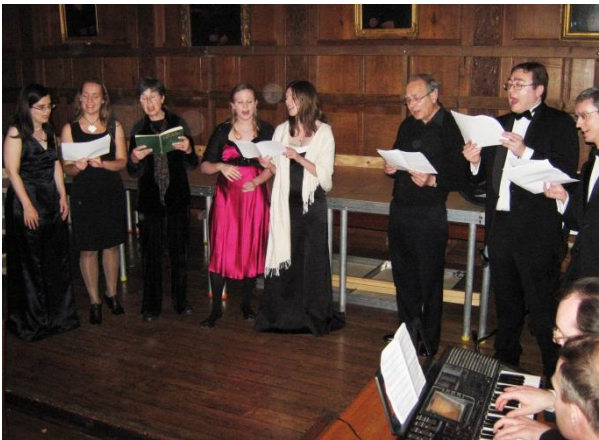
Boar's Head Carol

The Green Room welcomed arrivals for a sparkling reception. At a respectably decadent hour we doubled up the stairs to the magnificent upper level Great Hall. Appropriately enough here at loft level ' Marinated wood pigeon breast salad with French leaves and a blackcurrant dressing ' swooped to the tables. ' Skewered monkfish fillet and king prawn tails with garlic and rosemary cream ' followed. Complementing the gifts of the air and sea came ' Filet de chevreuil Wellington avec selection de pommes de terre et legumes de saison '. It was then time for the Carols, in keeping with the evening these received a double billing, delivered in two parts and two languages.